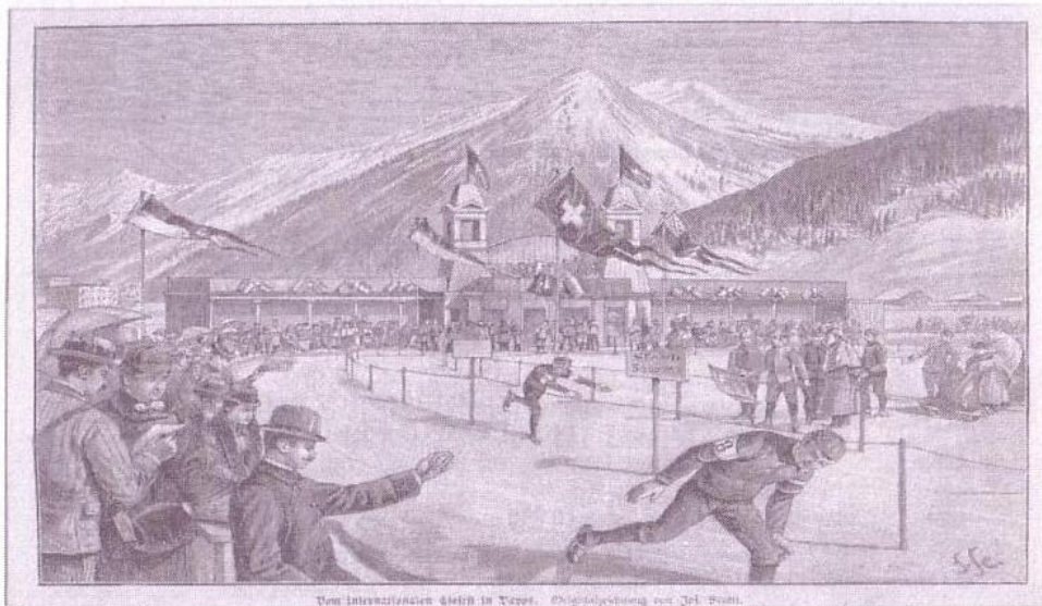
"From the International Ice Festival at Davos" woodcut from drawing by Jos. Scotti, about 1885

The Speed Skating Competitions, consisting of races over several distances, will be held under the regulations of the International Masters Speed Skating Committee (IMSSC) and the International Skating Union (priority of the rules in the aforesaid succession). The standard track, 400 meter to the lap, laid out on the Davos open air natural ice rink has the inner and outer curves with radii of 25 and 30 meters respectively with one warm up track.