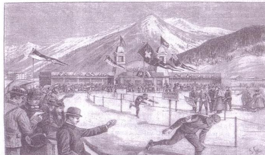
Das Internationale Eisfest in Davos. Originalzeichnung von Jos. Scotti.

"From the International Ice Festival at Davos" woodcut from drawing by Jos. Scotti, about 1885