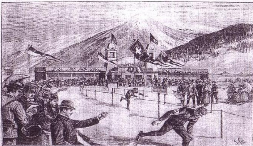
Dans Internationaler Skatklub in Davos.